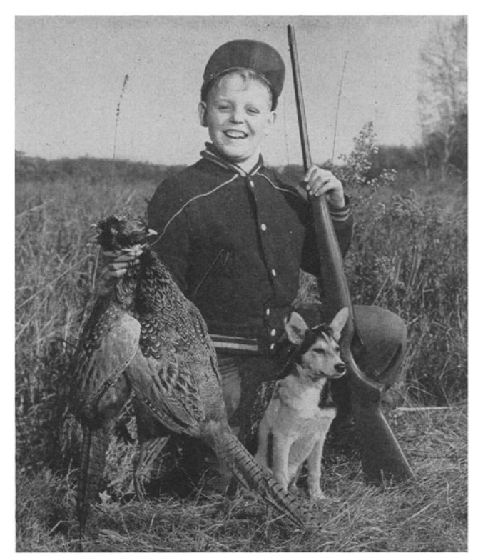
HUNTING—If your boy likes hunting, plan a pheasant hunting trip to Minnesota or a neighboring state in conjunction with your attendance at the fall meeting of your A.O.C.S. in Minneapolis Oct. 11-13.

LURGI GESELLSCHAFT FUR WÄRMETECHNIK M.B.H. LURGIHAUS · FRANKFURT AM MAIN · GERMANY