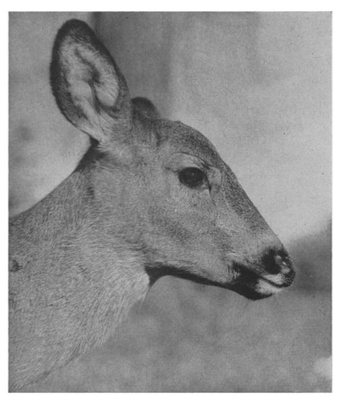
WHITETAIL DOE — The Minnesota deer herd is now larger than when the Chippewa and the Sioux nations roamed and warred over the wilderness. Suppression of predatory animals and the adaptability of the whitetail to civilization have been responsible for this increase. An annual harvest is now necessary in many areas to prevent over-population, over-grazing, and starvation during the winter.

years in the varsity backfield at Smith really paid off. The Chief made two mistakes after dragging his dripping form from the drink. One was in pausing for his war club, and the second was in stepping on the kid's tricycle. His holey moccasins didn't help much on that rocky path either. Anyway, Grandma reached the asylum of the Bunyan brothers' cabin. Now the Chief, medicine man Naynub, and the Naynub renegades are a-hootin' and a-hollerin' in the surrounding brush—but at a plenty safe distance, you may be sure.